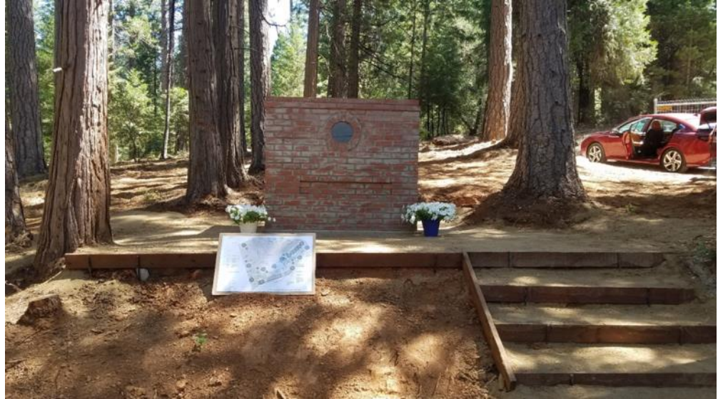
Funerary burner in Dutch Flat Chinese Cemetery, July 2024

Construction of the funerary burner began in early June, 2024 and its brickwork was completed before July 4th. De-