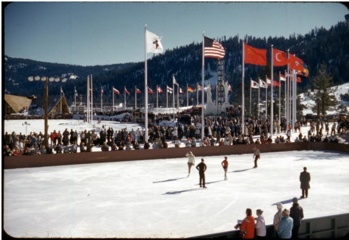
Skating rink at the 1960 Winter Olympics, February 1960.

This annual event gives you the chance to explore four Sacramento archives: the Central Library, State Library, State Archives, and the Center for Sacramento History. Dozens of other local repositories will also be in attendance to show off the hidden treasures of their archives and special collections. With a free shuttle bus to take you between locations, it can't be beat! For more details visit: https://sacarchivescrawl.blogspot.com/ .