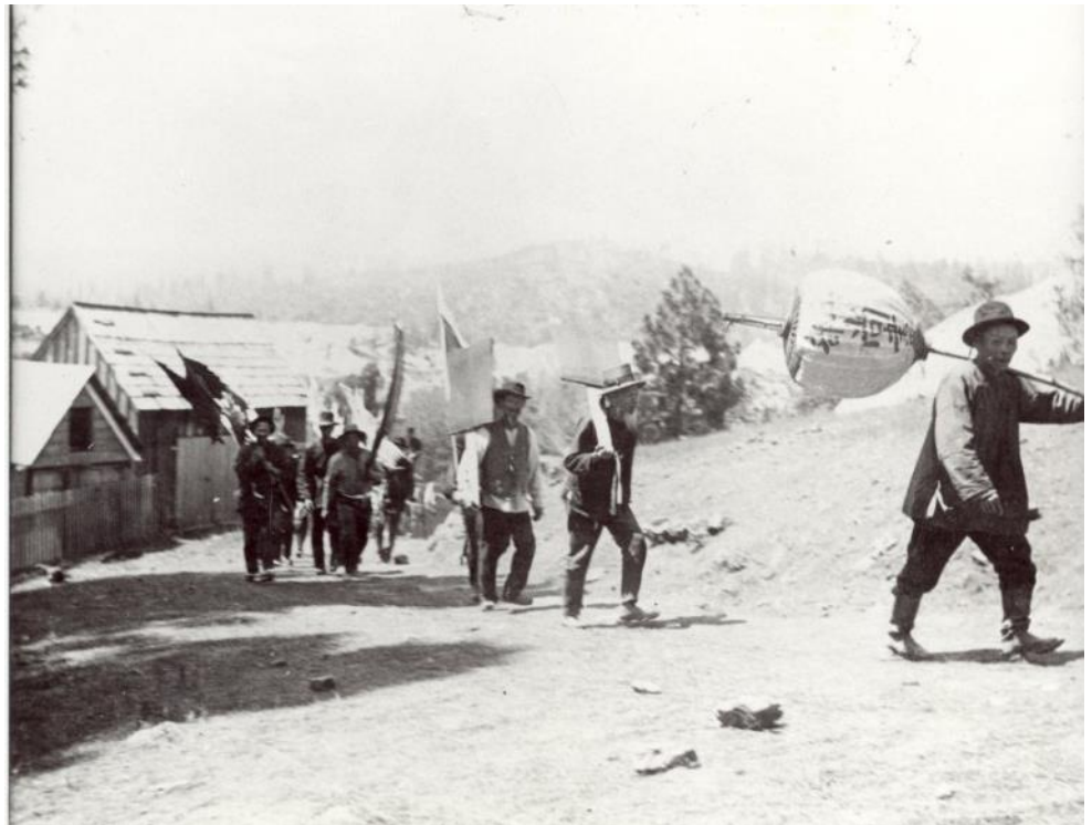
Chinese procession in Dutch Flat.

Once the location of gravesites was known a garden designer, Kate Bowers of Grass Valley, was chosen to develop a design for the public area of the Cemetery. Kate's design includes a stone staircase to enter, gravel walkways, benches, and a brick funerary burner with flagstone surround. Placer County Parks and Grounds Department continued to work with us, grading and surfacing the entrance road, the public area to facilitate gathering, and installing temporary stairs. A native plant plan was produced by landscape designer, Lora Piscatelli of Dreamscapes in Alta.