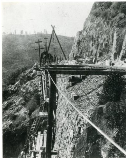
Construction of Cape Horn section of TCRR

The Transcontinental Railroad turned 150 years old on May 10. Two months and ten days later, we will celebrate the 50th anniversary of our first steps on the lunar surface. If you happen to be one of those who thinks we didn't land on the moon, you might as well not believe in the Transcontinental Railroad either.