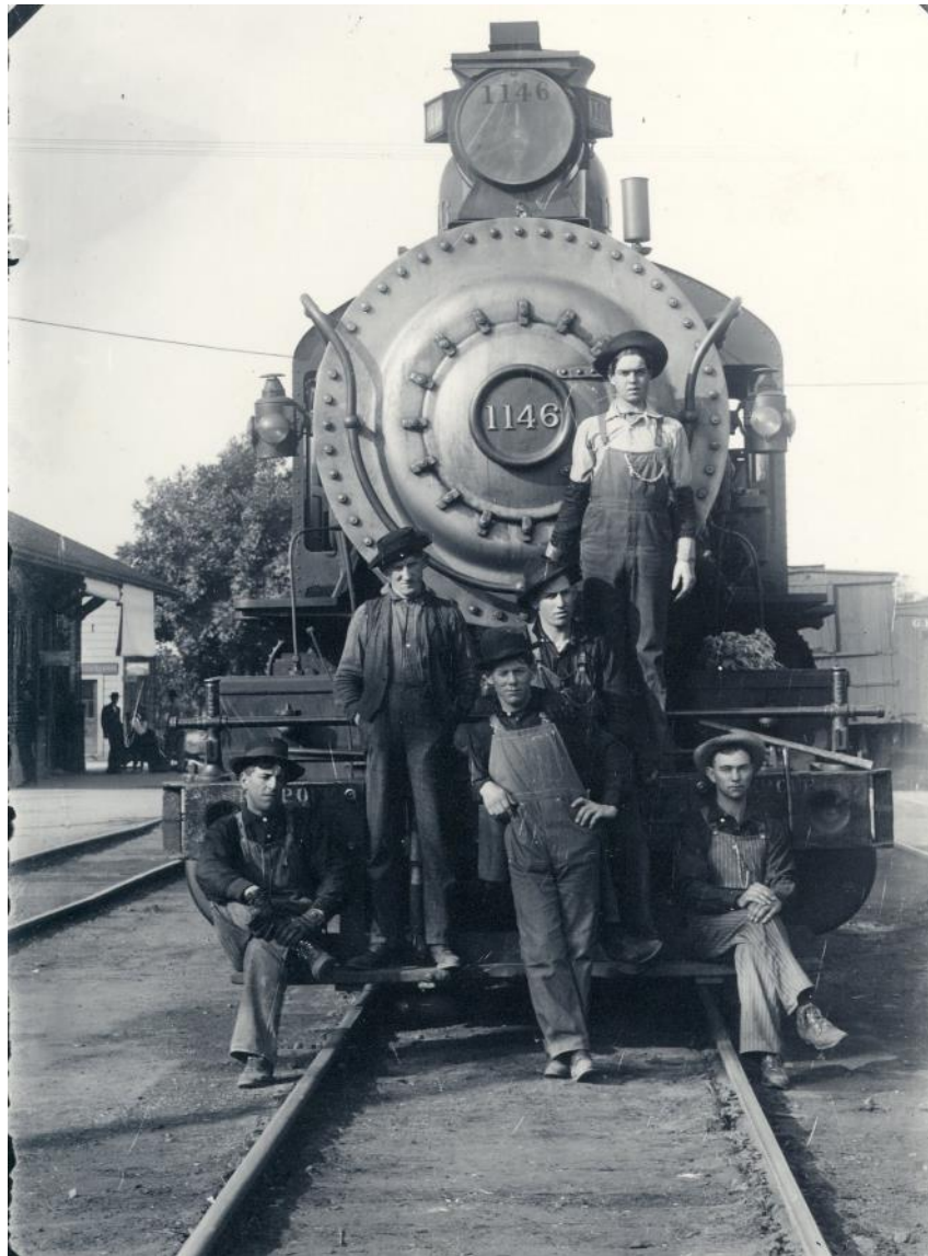
Workmen in front of a locomotive. Location unknown. Watch chains visible on front pockets of three men on the right side of the image.

Today, train traffic is controlled by satellite communication and a centralized traffic control system. Wristwatches replaced pocket watches for railroad staff, but pocket watches remain very popular among collectors.