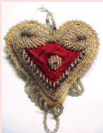
Pincushion, circa 1849. PCM Object #: 1965.24.10

Placer County Genealogical Society general meeting, Beecher Room, Auburn Library. (866) 894-2076