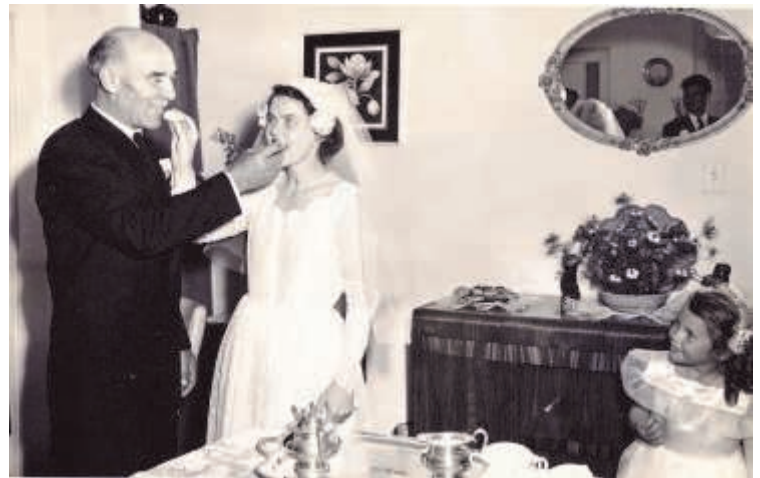
Unnamed couple feeding each other wedding cake. Circa 1950.

the possibilities are endless. All we can hope for is that they taste good!