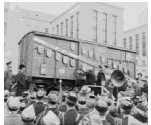
The arrival of the Merci Train (U.S. state unknown).