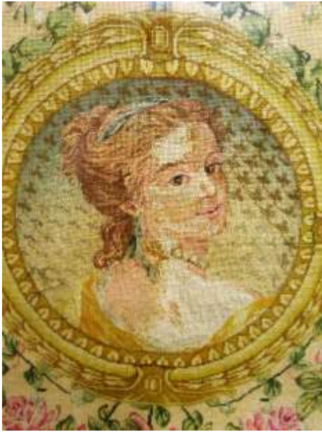
27" x 36" Tapestry from the Merci Train, depicting Comtesse Du Barry, courtier and mistress of King Louis XV. (pre-beheading)

by Kasia Woroniecka Curator of Collections