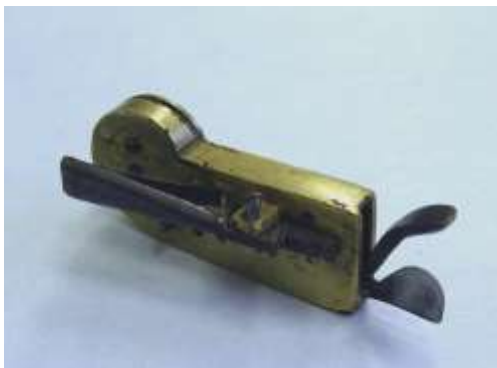
A fleam, or bloodletter, from the Lininger collection.