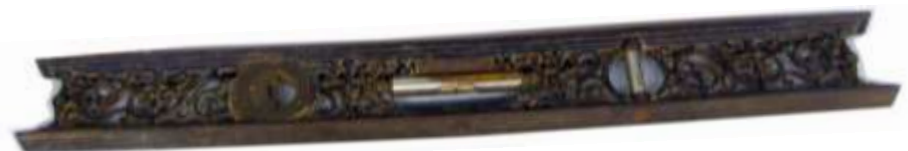
Ornate carpenter's level from the Lininger tool collection.