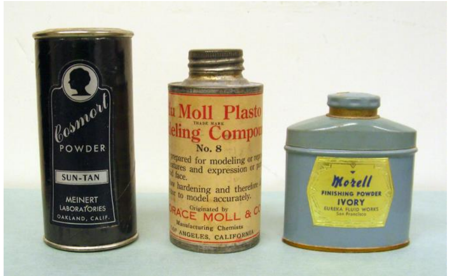
Mortician makeup. Cosmort Powder, Moll Plasto Finishing Compound and Morell Finishing Powder, c. 1930s. Placer County Museums Collection.

There are two ways to embalm the body. Viscerally where the fluids are pumped in the body cavities and arterially where the fluids are