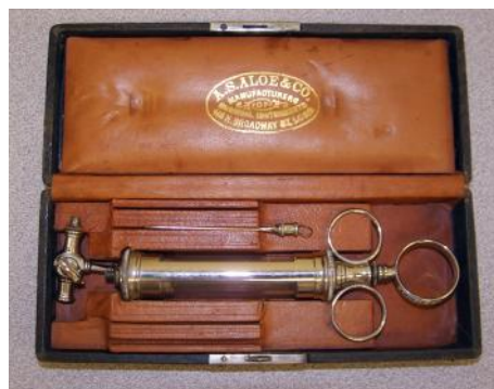
Syringe set. A. S. Aloe and Co. Manufacturers of Surgical Instruments, c.1885.

pumped into the arteries. Three to four gallons of embalming fluid are needed to embalm the body. Embalming fluid consists of a variety of chemicals and preservatives that slow the decomposition process. One of them is formaldehyde which most states started using around 1906 to replace the use of arsenic. Formaldehyde is still used in today's fluids, along with