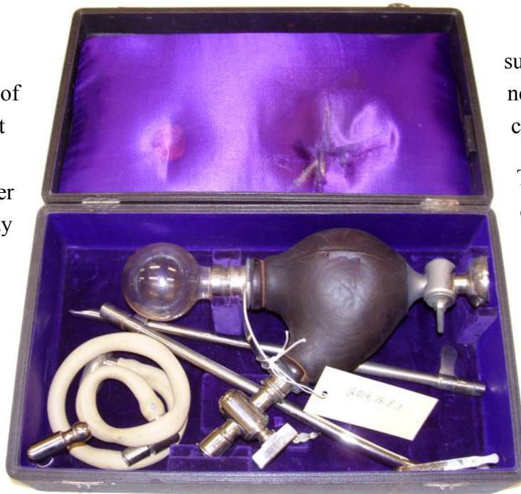
Surgical set with pump, Placer County Museums Collection

Preparing human remains for that final journey is not a job for the squeamish or the fainthearted. That is evident when looking at