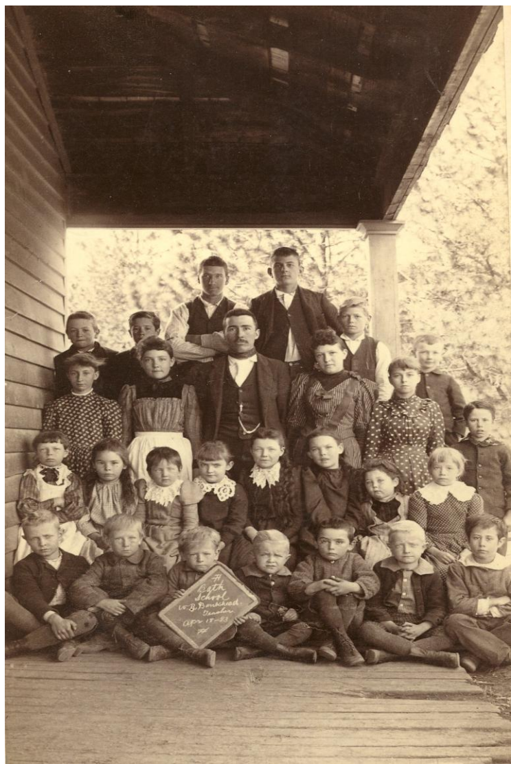
Bath School, 1893

Bath is located 1.5 miles (2.4 km) northeast of Foresthill. It lays at an elevation of 3,442 feet (1049 m).