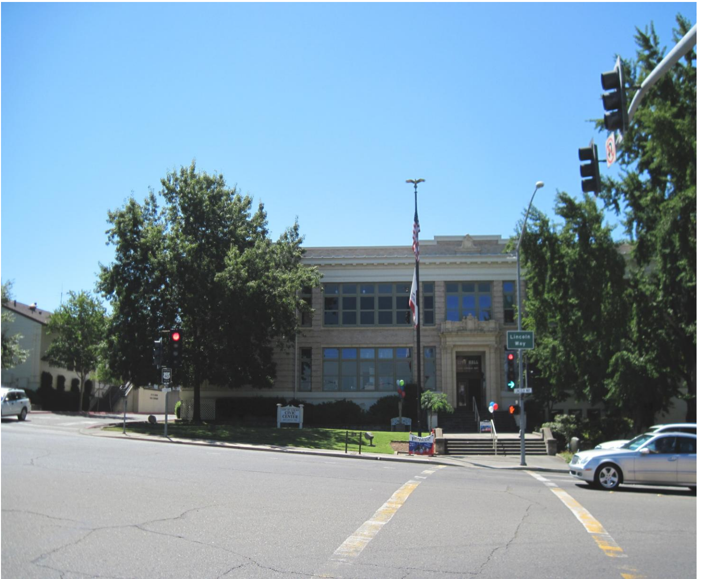
Auburn Grammar School, now City Hall