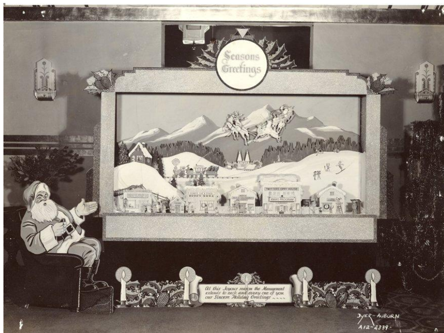
Christmas Display at the State Theatre in 1939